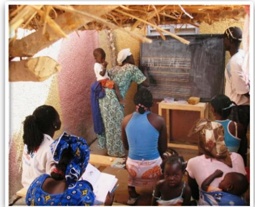
A literacy class